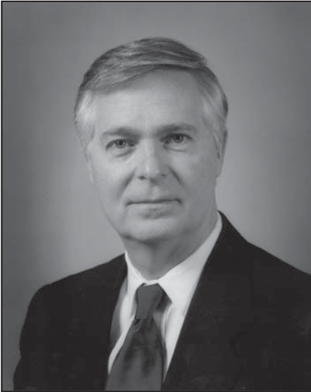
The Honorable Michael F. Easley Governor of North Carolina

S mall businesses are vital to the growth and development of communities throughout our state. They bring innovative products and service to the marketplace and provide a range of opportunities and jobs for North Carolina workers. Over the years, our state has made investments in business development support resources such as the Small Business and Technology Development Center, the North Carolina Biotechnology Center, and the Technological Development Authority.